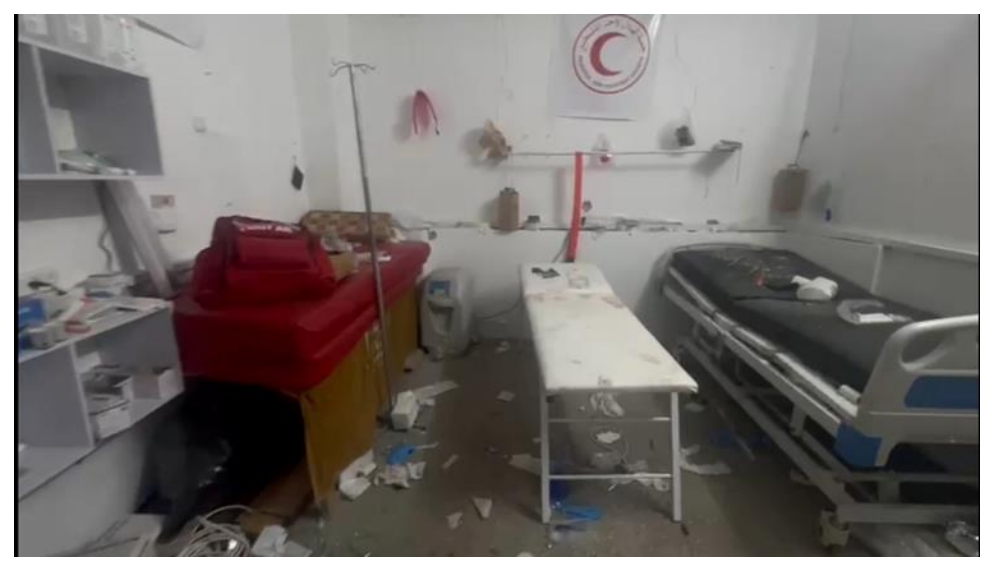
Damage done to the stabilisation point in Nur Shams camp, Tulkarem, following an Israeli incursion on 16-17 December 2023.

N*, an MSF-trained nurse at the Thabet Thabet Government Hospital in Nur Shams camp, took the initiative to establish a stabilisation point in Nur Shams and encouraged volunteers from Tulkarem camp to do the same. Initially, Nur Shams camp had one stabilisation point, while Tulkarem camp had two. Unfortunately, these stabilisation points were targeted by the Israeli forces during incursions, resulting in partial destruction, including damages to materials donated by MSF.