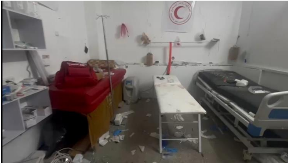
Damage done to the stabilisation point in Nur Shams camp, Tulkarem, following an Israeli incursion on 16-17 December 2023.

N*, an MSF-trained nurse at the Thabet Thabet Government Hospital in Nur Shams camp, took the initiative to establish a stabilisation point in Nur Shams and encouraged volunteers from Tulkarem camp to do the same. Initially, Nur Shams camp had one stabilisation point, while Tulkarem camp had two. Unfortunately, these stabilisation points were targeted by the Israeli forces during incursions, resulting in partial destruction, including damages to materials donated by MSF.